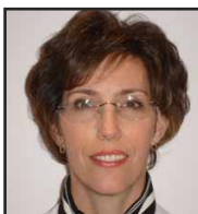
Glee Lenoir MCBG Pharmacy